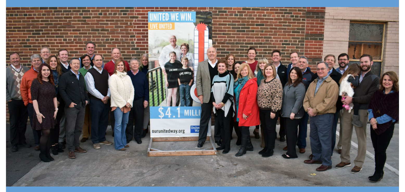
United Way's Board of Directors and Campaign Cabinet celebrate surpassing the 2018 Campaign Goal of $4.1 million!