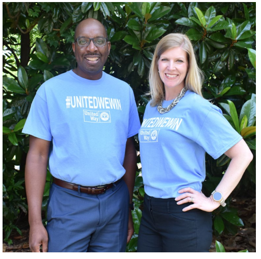
2,904 individuals provided with housing assistance