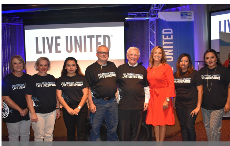
ENGINEERED FLOORS Five Star Champion, Community Builder, & Largest Dollar Increase