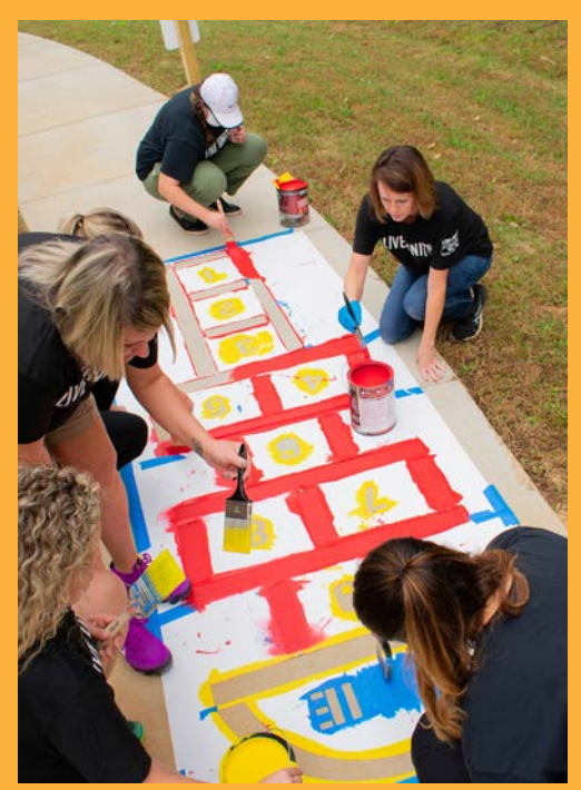
Phenix Flooring employees painting the path for the Born Learning Trail at Chatsworth-Murray Library.

Make A Difference Day, sponsored by Brown Industries and Phenix Flooring, mobilized 300 volunteers who gave 856 hours of service.