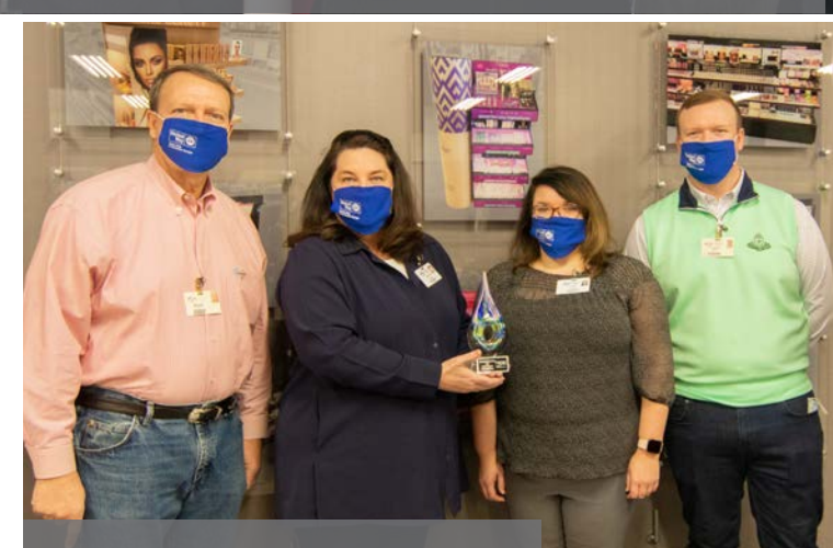
MARKETING ALLIANCE GROUP Five Star Champion & Community Patron