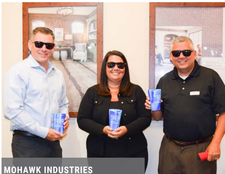
MOHAWK INDUSTRIES Five Star Champion & Community Builder

TEXTILE RUBBER & CHEMICAL CO. Community Patron