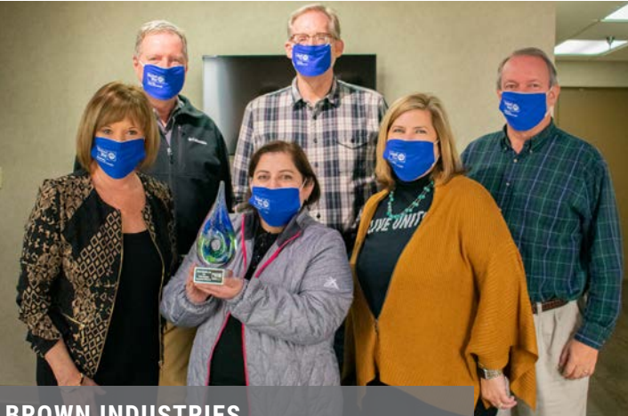
BROWN INDUSTRIES Five Star Champion & Community Collaborator